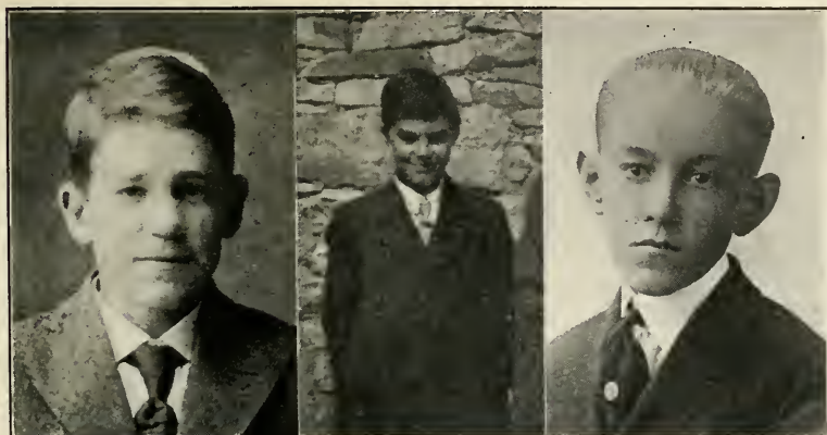
WINNERS IN THE M. I. A. VOCATIONS AND INDUSTRIES CONTEST, 1915

fluence many years. And if results are to be a test for education, the Boys and Girls' Clubs of Utah are a powerful factor.