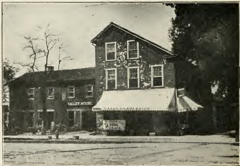
THE VALLEY HOUSE.

An old landmark in Salt Lake City, recently torn down to make way for the new Bamberger interurban railway station.