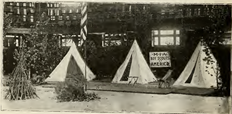
CAMP SCENE IN THE DESERET GYMNASIUM Y. M. M. I. A. Demonstration, June, 1916