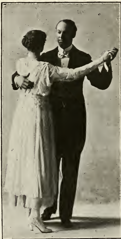
Showing Good Position for Gentleman's Arm