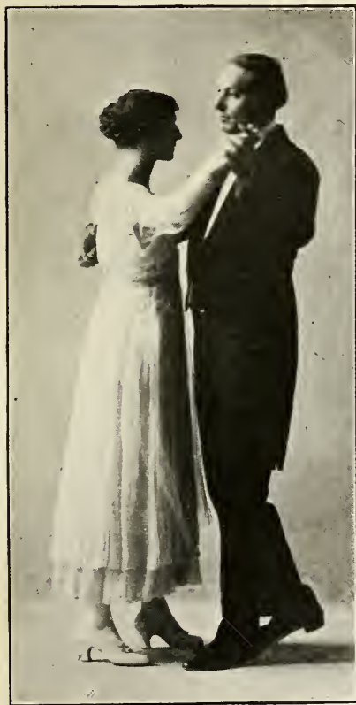
Showing Good Position

(h) In the olden days the ball room furnished an exhibition of stately, dignified bearing and courtesy. Most of the recent criticism of dancing is occasioned by the improper positions assumed in the modern dance. M. I. A. members should avoid any position in the dance which encroaches in the slightest degree upon modesty and refinement.