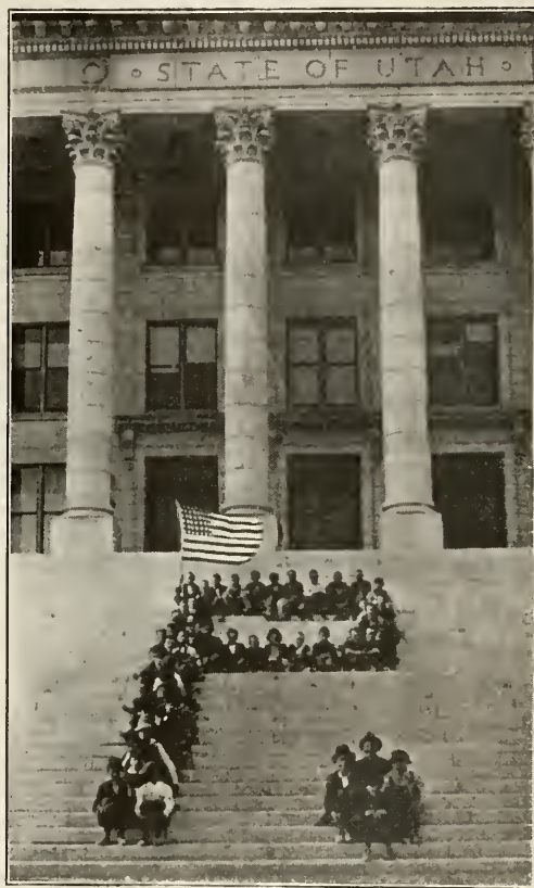
PIONEER STAKE BOY SCOUTS

will he plant, and water, and cultivate, and then not bring to the harvest and gather it? Such a conclusion is unthinkable. It is for us to labor in hope and confidence that God will give the increase. God grant that it may be so, in the name of Jesus Amen.