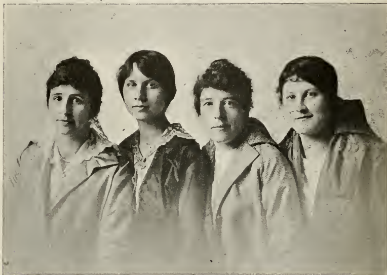
LADIES' QUARTET, PRATT WARD, TETON STAKE Winners in M. I. A. Contest, 1916.